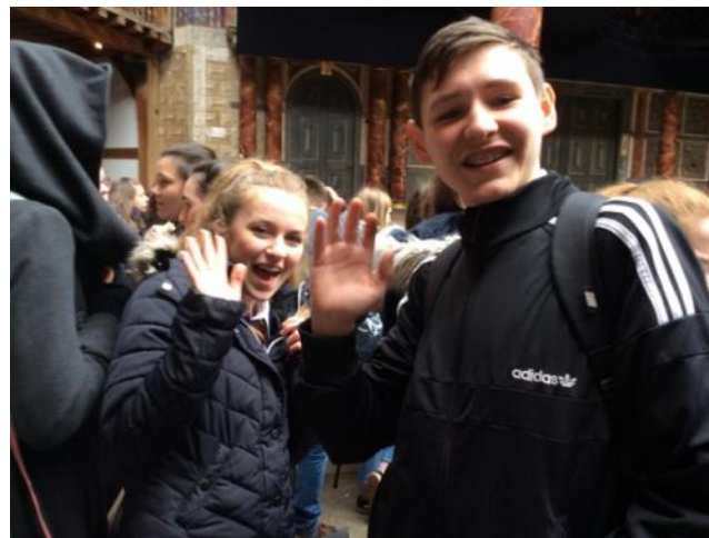
Students enjoying Shakespeare at The Globe Theatre

The production was certainly different from what most of us expected! It was really interesting to see a very modern and alternative interpretation performed in the traditional Globe Theatre. Emo Romeo was fab! We all loved the glitterball and YMCA during the party scene (a few students joined in too!) Juliet's performance was fantastic and more than a few of us were pretending our tears were really just the rain at the end.